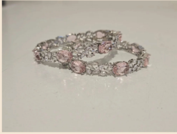
Blush Lust Bangles – Romantic Pink & Icy White