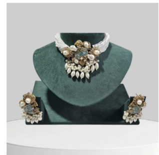
Pearl Choker With Gold Detailing & Statement Centerpiece