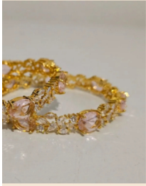
Bangles – Blush Pink &