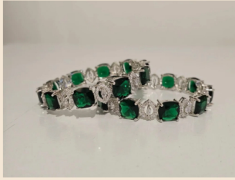
Medusa Emerald Bangles – Dramatic Green & White Gold Look