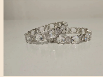
Cushion Sparkle Bangles – High-Carat Diamond-Look Set