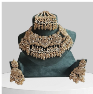
Gold-Plated Choker & Necklace With Pearls And Crystal Drops