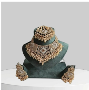
Gold-Plated Choker & Necklace With Peach Beads And Crystals