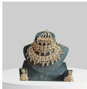
Gold Bridal Choker With Crystals, Pearls & Luxe Detailing